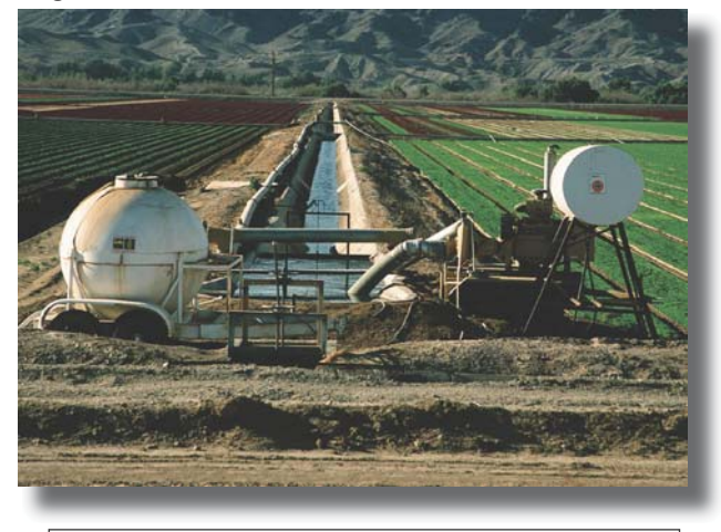
Fertilizer application applied directly into irrigation lateral for flood application, Yuma, AZ.

Once in the environment, E. coli O157 can move in several ways around agricultural landscapes. The two most common ways are through the land application of raw, uncomposted manure, and through runoff of manure or lagoon water into streams and irrigation ditches.