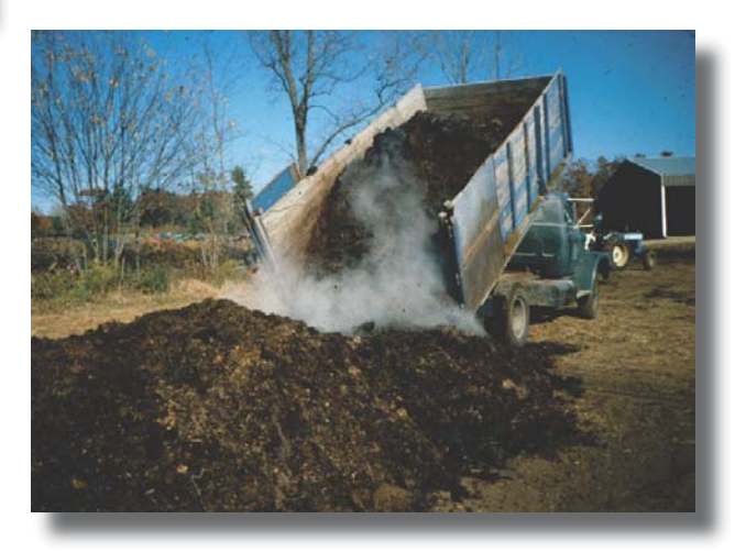
Building compost windrows in Massachusetts.

Most scientists who have studied the impacts of manure management, composting systems, and manure and compost application methods on E. coli survival in the soil and on crops agree that further research is needed to assure adequate margins of food safety. The results of most published research supports the conclusion that under normal conditions, properly managed and applied manure and compost, on organic and conventional farms, does not pose a food safety threat. But published research also shows clearly that margins of safety are not great enough to eliminate risk under combinations of unusual conditions that might include odd weather, unusual pest problems, operator error, equipment failures, lack of effort in sanitizing equipment, or lack of knowledge.