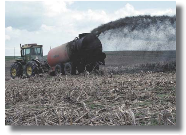
Liquid manure being pumped with a "honey wagon."

In a unique study focusing on E. coli O157 cases in Canada, scientists used 80 indicators of livestock density to study linkages between farm animals and E. coli illnesses. The strongest positive association between E. coli case frequency and a livestock density indictor was the ratio of beef cattle population to human population (Valcour et al., 2002).