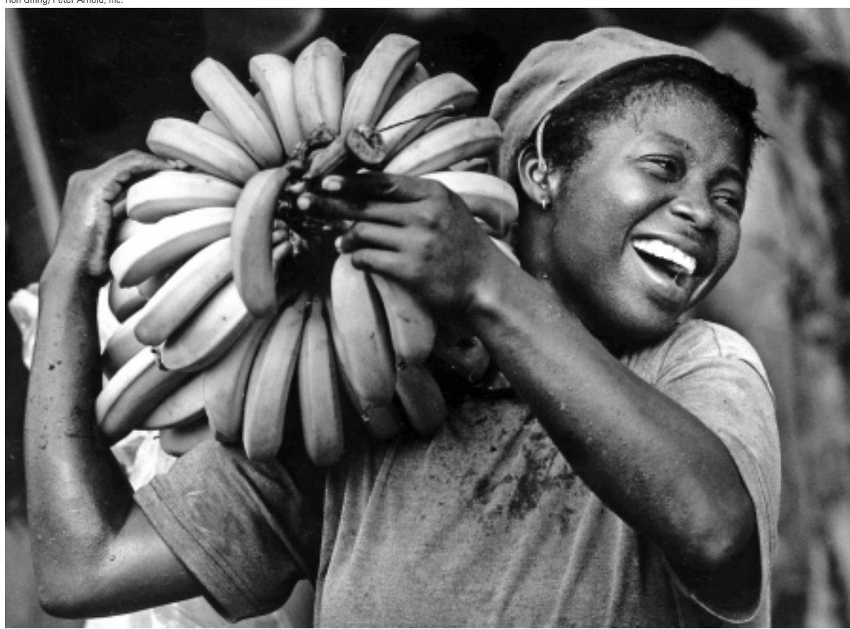
Harvesting organic bananas, near Lake Volta, Ghana.

believe that a global conversion to organic farming would not proceed as seamlessly as plugging some yield ratios into a spreadsheet.