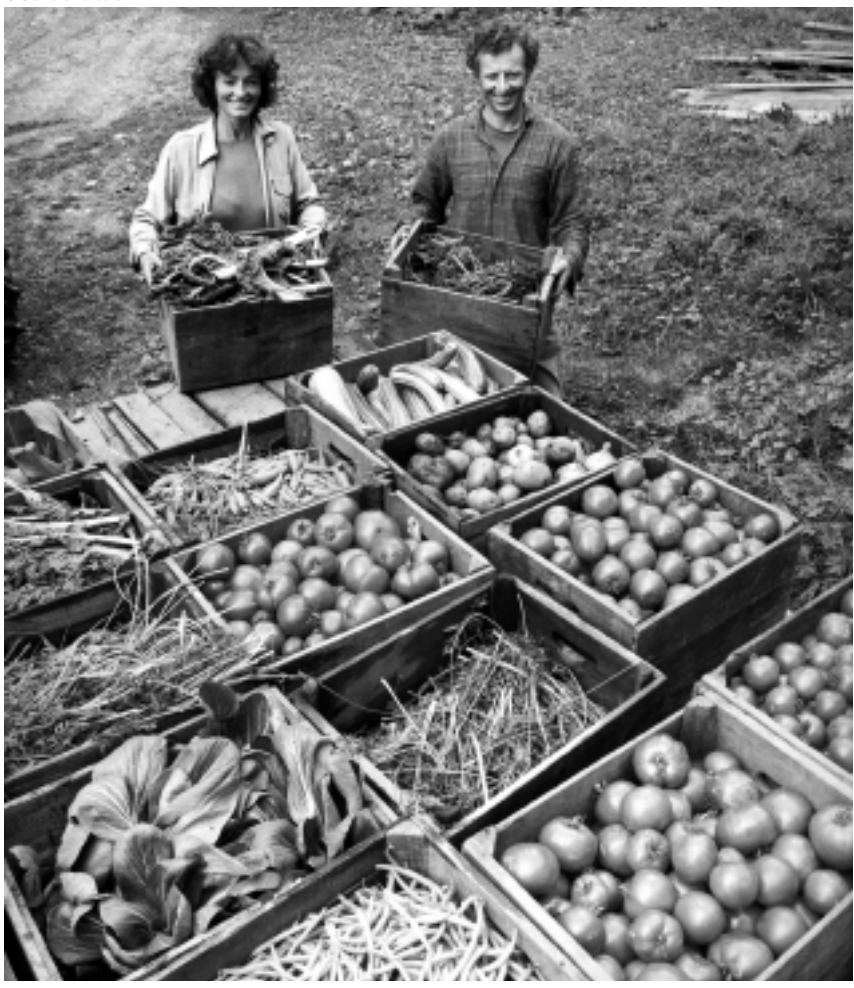
Farmers loading their organic harvest, Indian Line Farm, Massachusetts, U.S.A.

Research Institute (IFPRI). This model is considered the definitive algorithm for predicting food output, farm income, and the number of hungry people throughout the world. Given the growing interest in organic farming among consumers, government officials, and agricultural scientists, the researchers wanted to assess whether a large-scale conversion to organic farming in Europe and North America (the world's primary food exporting regions) would reduce yields, increase world food prices, or worsen hunger in poorer nations that depend on imports, particularly those people living in the Third World's swelling megacities. Although the group found that total food production declined in Europe and North America, the model didn't show a substantial impact on world food prices. And because the model assumed, like the Michigan study, that organic farming would boost yields in Africa, Asia, and Latin America, the most optimistic scenario even had hunger-plagued sub-Saharan Africa exporting food surpluses.