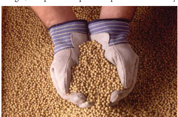
2 http://www.bloomberg.com/apps/news?pid=20601103&sid=aL W8VZBkP3PA#

Farmers that plant purchased, conventional soybeans in 2010 will have a seed-to-soybean price ratio of about 3.6, taking into account the average $1.00 per bushel premium paid for non-GE soybeans.