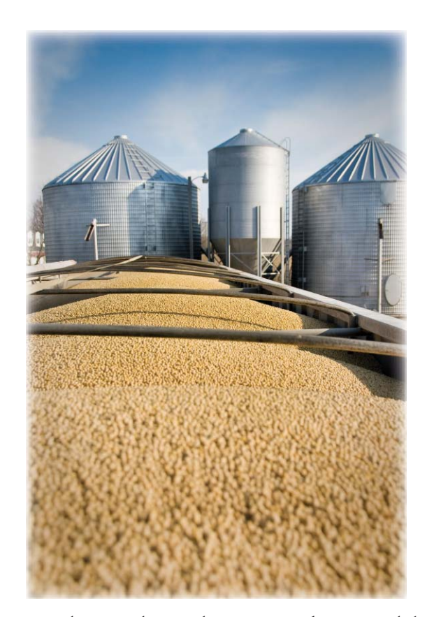
per acre. In short, seed expenditures were taking a much larger slice out of the gross income "pie."

In 2009, average national soybean yields were relatively high (41.4 bushels per acre) and average prices were very strong, at $9.00 per bushel, producing average gross market returns of $372.60 per acre. Conventional soybean seed cost $41.56 and GE seed $61.17 per acre, accounting for 11.2% of gross crop income in the case of conventional seed, and 16.4% for GE seeds.