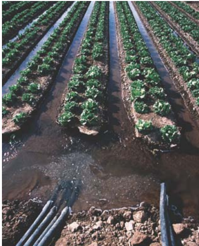
Siphon tubes used for furrow irrigation on Romaine lettuce, Yuma, AZ.

Survival times vary greatly as a result of soil and weather conditions. Avery et al. (2005) found that E. coli O157 bacteria were still viable in 77% of a number of organic wastes two months after land application. They concluded that storage of wastes will help reduce bacteria numbers, but cannot be counted on to totally eliminate E. coli O157.