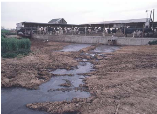
Runoff from this livestock yard may enter a nearby stream and degrade water quality.

Gilbert et al. (2005) found that enterohaemorrhagic E. coli [EHEC] levels were 100-times higher in cattle feed a high grain ration, compared to animals on a roughage-based diet. Herriot et al. (1998) reported that dairy heifers feed corn silage were more likely to have E. coli O157, compared to heifers not feed silage.