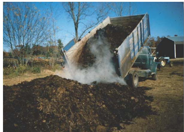
Building compost windrows in Massachusetts.

Most scientists who have studied the impacts of manure management, composting systems, and manure and compost application methods on E. coli survival in the soil and on crops agree that further research is needed to assure adequate margins of food safety. The results of most published research supports the conclusion that under normal conditions, properly managed and applied manure and compost, on organic and conventional farms, does not pose a food safety threat. But published research also shows clearly that margins of safety are not great enough to eliminate risk under combinations of unusual conditions that might include odd weather, unusual pest problems, operator error, equipment failures, lack of effort in sanitizing equipment, or lack of knowledge.