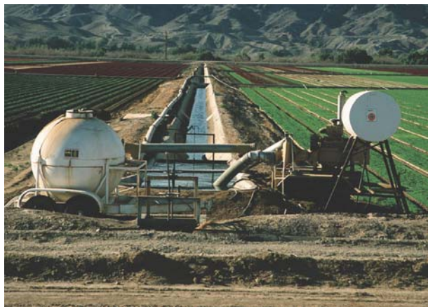
Fertilizer application applied directly into irrigation lateral for flood application, Yuma, AZ.

Once in the environment, E. coli O157 can move in several ways around agricultural landscapes. The two most common ways are through the land application of raw, uncomposted manure, and through runoff of manure or lagoon water into streams and irrigation ditches.