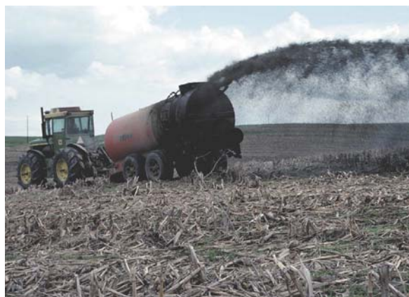
Liquid manure being pumped with a "honey wagon."

In a unique study focusing on E. coli O157 cases in Canada, scientists used 80 indicators of livestock density to study linkages between farm animals and E. coli illnesses. The strongest positive association between E. coli case frequency and a livestock density indicator was the ratio of beef cattle population to human population (Valcour et al., 2002).