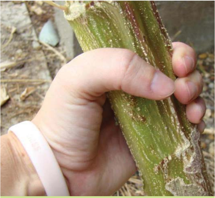
The stalk of a mature Palmer amaranth weed can reach six inches in diameter, and can damage mechanical cotton pickers.

The widespread adoption of glyphosate-resistant (GR), RR soybeans, corn, and cotton has vastly increased the use of glyphosate herbicide. Excessive reliance on glyphosate has spawned a growing epidemic of glyphosate-resistant weeds, just as overuse of antibiotics can trigger the proliferation of antibiotic-resistant bacteria.