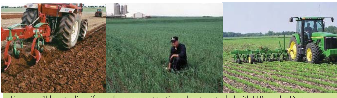
Farmers will have to diversify weed management tactics and systems to deal with HR weeds. Deep tillage (left photo) buries weed seeds; cover crops (center) can repress weed germination and growth; and mechanized cultivation between plant rows (right) is a proven alternative to herbicides.

cotton fields in 2003, about when experts predicted field resistance would emerge.