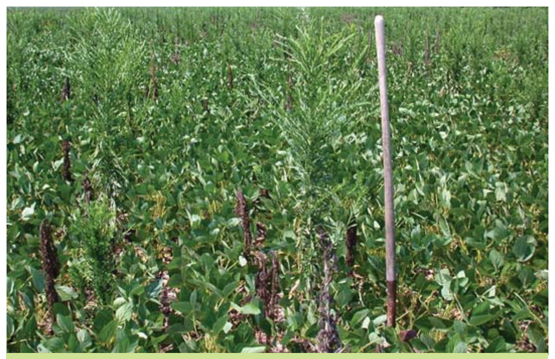
Heavy infestations of resistant weeds in cotton fields reduce crop yields and increase costs of production. Resistant populations of weeds can grow as tall, or taller than a hoe handle and produce several hundred thousand seeds per plant.

Bt cotton has now been grown for 14 years, but the acreage planted to it did not reach one-third of national cotton acres until 2000. Plus, the first populations of Bt resistant bollworms were discovered in Mississippi and Arkansas