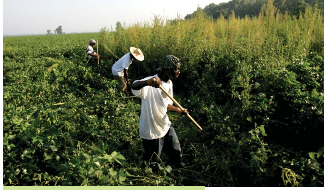
ecosystems, and much more frequent instances of herbicide-driven damage to nearby crops and plants, as a result of the off-target movement of herbicides.

Growing reliance on older, higher-risk herbicides for management of resistant weeds on HT crop acres is now inevitable in the foreseeable future and will markedly deepen the environmental and public health footprint of weed management on over 100 million acres of U.S. cropland. This footprint will both deepen and grow more diverse, encompassing heightened risk of birth defects and other reproductive problems, more severe impacts on aquatic