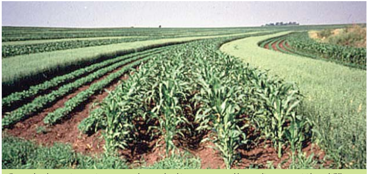
Corn and soybean strip-cropping systems reduce weed and insect pressure and lessen reliance on pesticides and GE crops