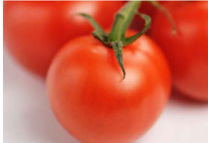
A recent study documented a near-doubling in the levels of two antioxidants in organic tomatoes.

crops. And, as organic farmers find ways to push yields close to the levels on conventional farms, the nutritional advantage of organic systems may narrow, and even disappear in some cases. Research is needed to identify farming systems and plant genetic innovations capable of increasing the nutrient content of foods without significant impacts on yields.