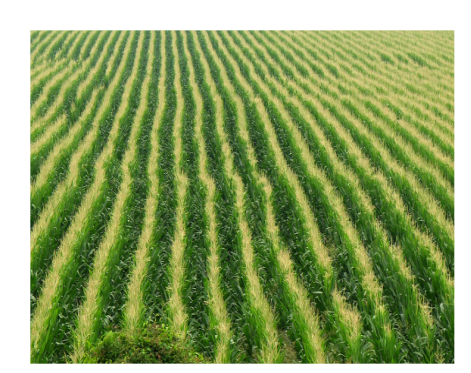
Many farmers now plant 30,000 or more corn seeds per acre, about three times the planting density common in the 1940's. The volume of corn grain harvested per corn plant has changed little in the last half-century.

The unintentional and largely unnoticed slippage in nutrient density has been accepted as a price of progress in boosting yields. After all, more total nutrients are harvested from a field of corn producing twice the yield, even if it means 20 percent less protein or iron per bushel. In addition, fortification of food with vitamins and minerals has been available. and used, to address blatant deficiencies in nutrient intake.