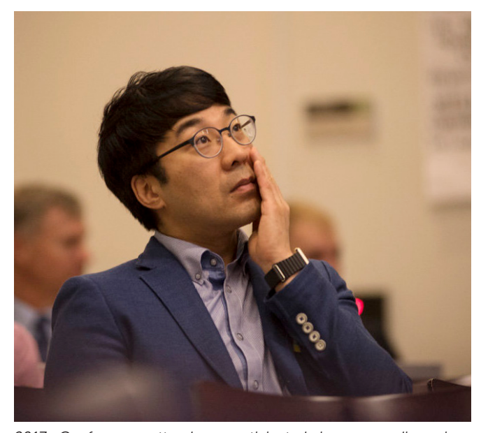
2017 Conference attendees participated in group discussions exploring challenges to research development and communication

One final consideration in the area of effective results dissemination is the choice of whether to disseminate research results at all. This may occur in the case of non-significant results due to publication bias, where scientific journals preferentially publish studies with significant results, or if a researcher chooses not to publish their research because results are non-significant. For example, if a study tests the efficacy of a variety of products in combating disease but finds that none of them is effective, researchers may choose not to or have trouble publishing or disseminating the results because they are considered uninteresting. Negative results, however, do provide very real and useful information to organic farmers. Because organic farmers are prohibited from using antibiotics, synthetic pesticides, mineral fertilizers and genetically engineered crop varieties, they are limited in the